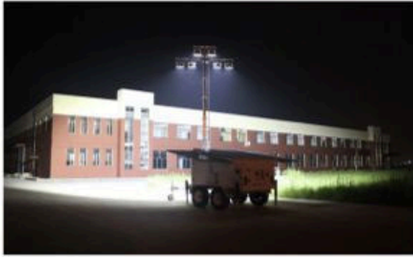
Model : JSSG600-A