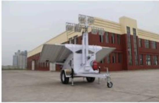
Model : JSS600-A